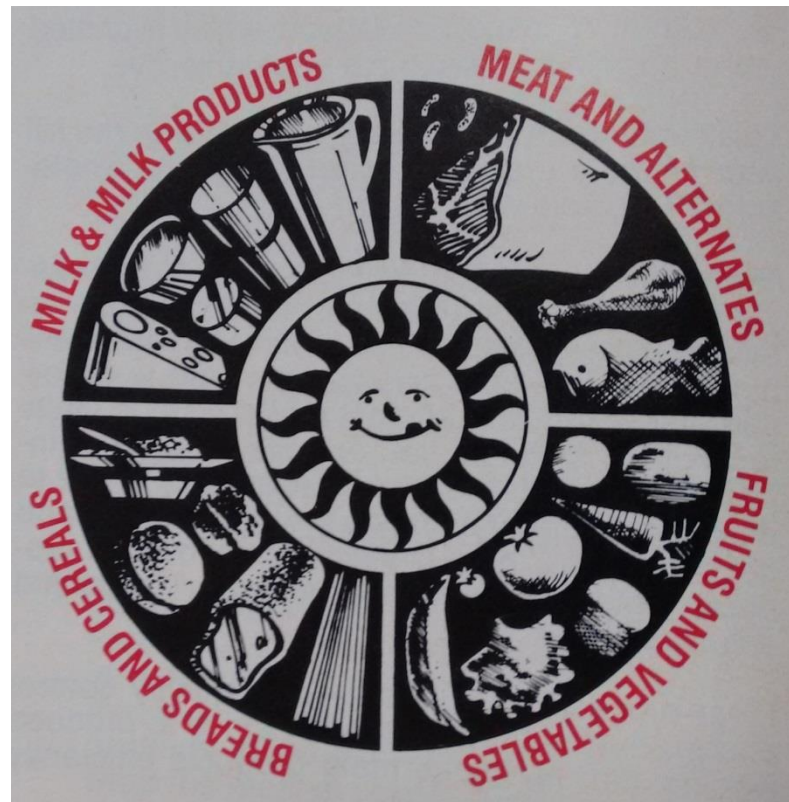
Figure 1. "Groups of foods" according to an informative leaflet – 1980s.

As it can be seen in Figure 1, meat and animal products occupy half the space of the food groups, which is revealing about the lobbies of livestock industries. It also helps to explain the enormous increase of meat and other animal products on the food habits developed through the course of the second half of the twentieth century (Weis 2016).